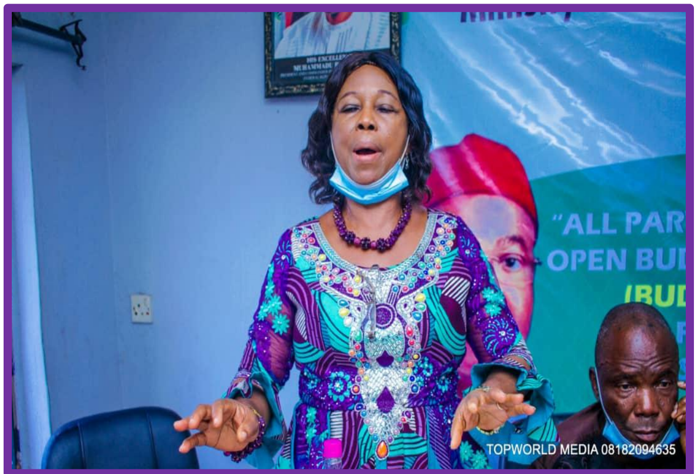
REPORT ON SENSITIZATION PROGRAMME ON IMO STATE PARTICIPATORY BUDGET STAKEHOLDER'S