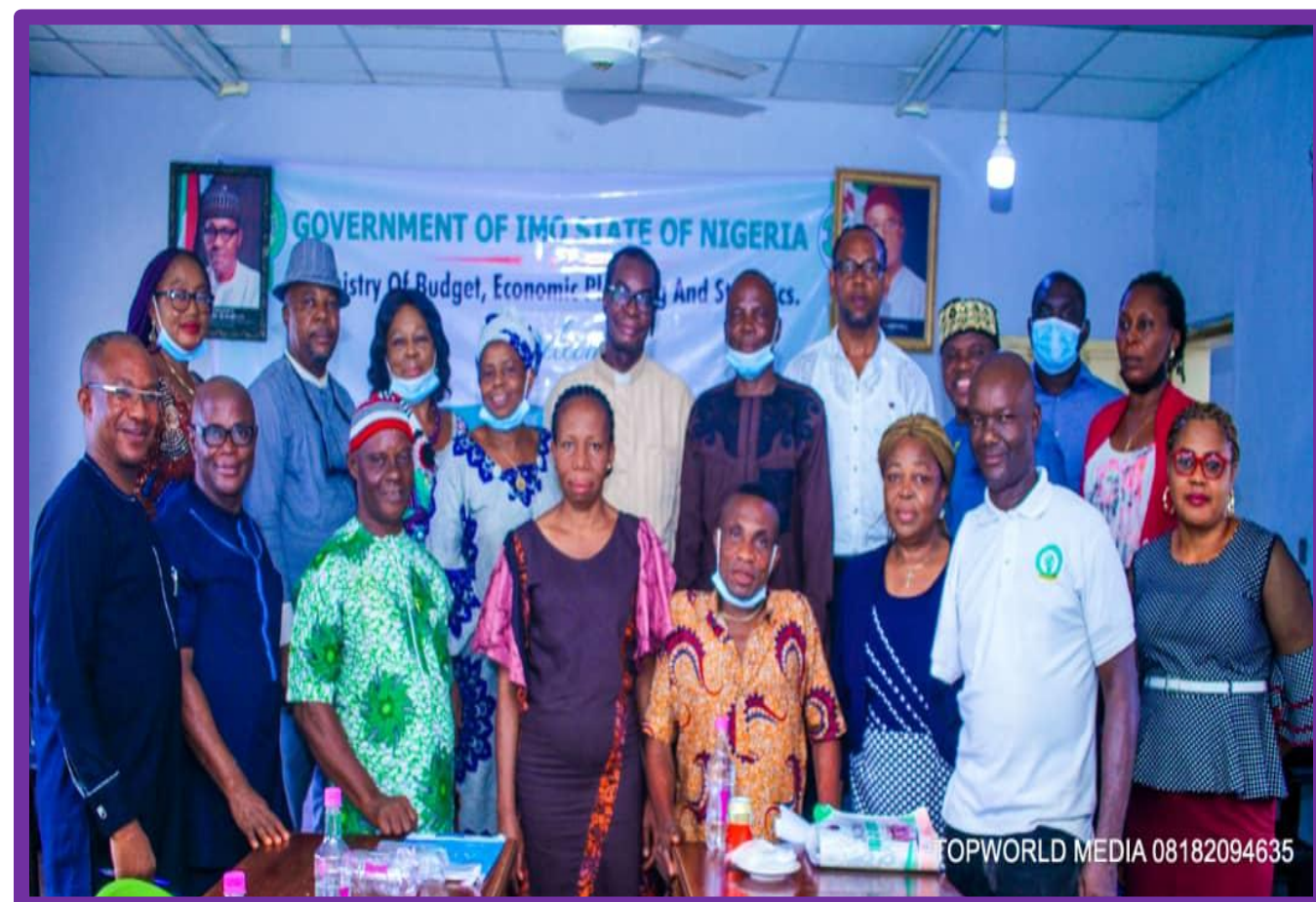
REPORT ON SENSITIZATION PROGRAMME ON IMO STATE PARTICIPATORY BUDGET STAKEHOLDER'S